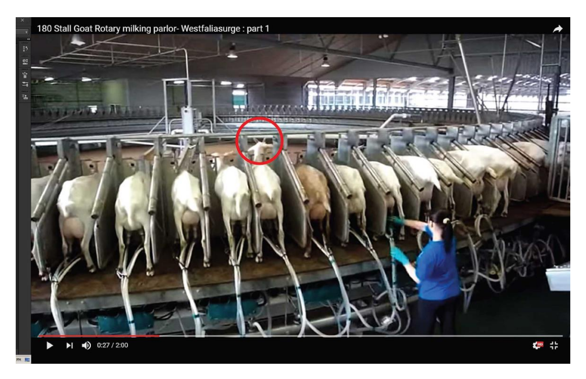
Picture 4: Screenshot from youtube video (<a href="https://www.youtube.com/watch?v=Bda12r1zOpg">https://www.youtube.com/watch?v=Bda12r1zOpg</a>) showing that even very big, commercial milking parlors can handle goats with horns, (even if most of the goats have been dehorned for other reasons).

During the first 9 years of goat farming, we lost a total of 82 animals. Only two of these casualties were related to horns. In both cases we had to shoot the goat because of a broken leg that got caught between the horns of another goat. This is a horn-related mortality of less than 0.2%. How does this compare to the mortality as a result of disbudding? Unfortunately, no data on mortality caused by de-horning or disbudding are available for goats. However, it seems fair to assume that the situation is similar to calves, where "...producers loose more than 2% of the calf-drop due to complications after dehorning (such as infection), MLA "Feedback" January/February 2014, page 11).