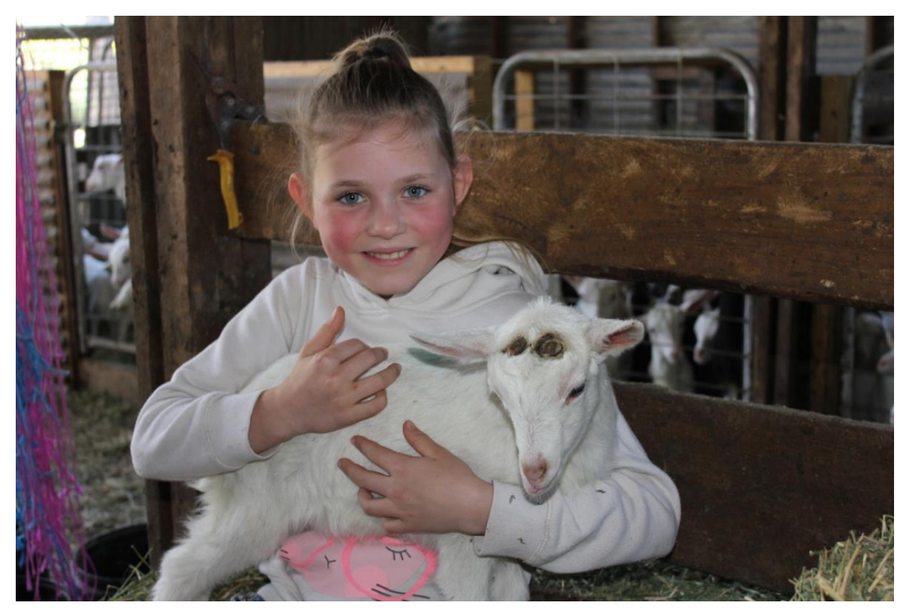
Picture 2: This picture is from the webpage of the Victorian Branch of the Dairy Goat Society of Australia (DGSA). It shows a girl with a goat kid that has been recently disbudded. Notice the big scars on the forehead of the goat kid!

I was honestly shocked when I first saw this picture. How can anybody with a normal and healthy perception about goat welfare find it cute and/or suitable to promote the DGSA?