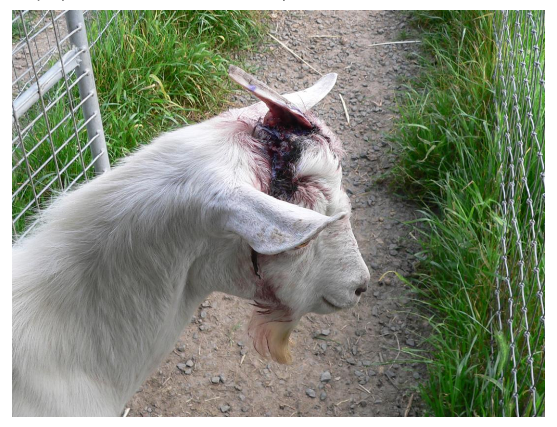
Picture 6: We could remove the scur on the right side, but failed on the other side because we could not control the bleeding

To avoid complications, we tried to completely remove the two loose scurs. This must have been very painful for the buckling, because he was crying and fighting, and tried to pull his head out of the head-bail. We were successful with the scur on the right side, but could not control the bleeding on the other side (Picture 6). It was obvious that proper surgery with anaesthesia, carried out by a professional veterinarian was required.